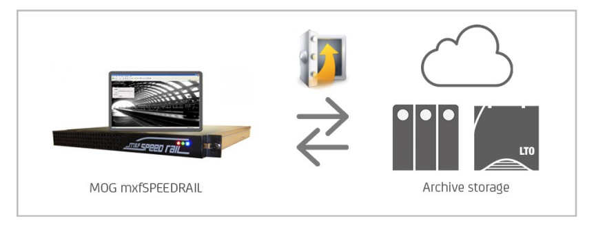
Archiving from mxfSpeedrail to Disk or Tape with P5 Archive

In the production process, making newly acquired material easily accessible for editing as soon as possible is key – and so is keeping it safe. The combination of mxfSPEEDRAIL by MOG and P5 Archive by Archiware does just that. Based on open industry standards and offering state-of-the-art technology, MOG has been establishing itself in the market as the worldwide supplier for both Centralized Ingest Solutions and MXF Development Tools.