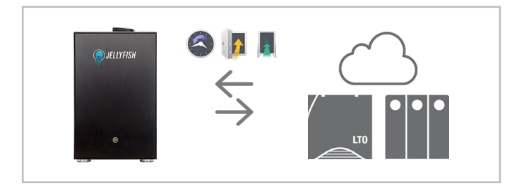
P5 Archive, Backup and Synchronize from Jellyfish

P5 Archive comes in when long-term storage is required. Archived media and projects are comprised in the P5 Archive catalogue, including previews for visual browsing. User-definable metadata fields and extensive search features make it incredibly easy to find that special clip and restore it quickly and easily with just one click.